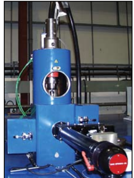
Heavy duty 60 kV up to 15 kW

CCTV & conventional optical systems can be provided with a splitter box that enables both to be used but not simultaneously.